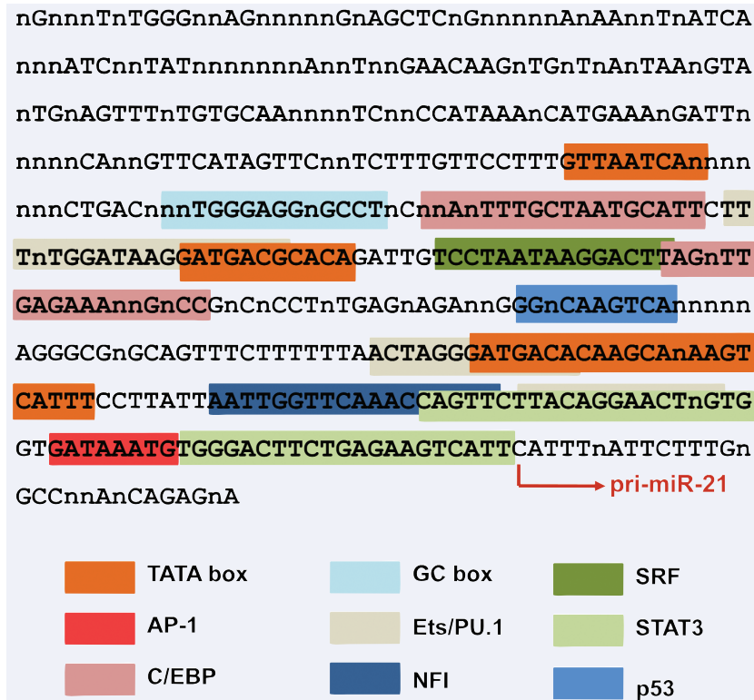
Fig. 1 The consensus sequence of putative promoter region of miR-21. Conserved bases across vertebrates are shown in capitals and non-conserved bases or deletions are denoted by 'n'. The arrow indicates the transcription start site of pri-miR-21. Conserved regions of various transcription factors are indicated by different colours. Two additional RE-1-binding elements responding to transcription factor REST are located at 7214 and 7100 bp upstream of the miR-21 transcription start site [38]. This figure is reproduced from reference 25.